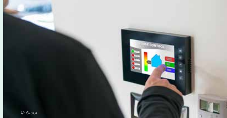
Possible application for haptic structures in glass.