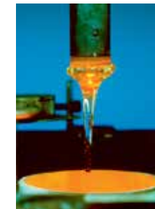
Test specimen in contact with hot glass.

The Fraunhofer IWM has many years of experience in developing coatings of molds. Thus individually designed mold tool coating solutions are available to suit customers' specific needs. The stability and service life of such coatings can be tested at the Fraunhofer IWM for their resistance to hot glass melts in an extended-time test.