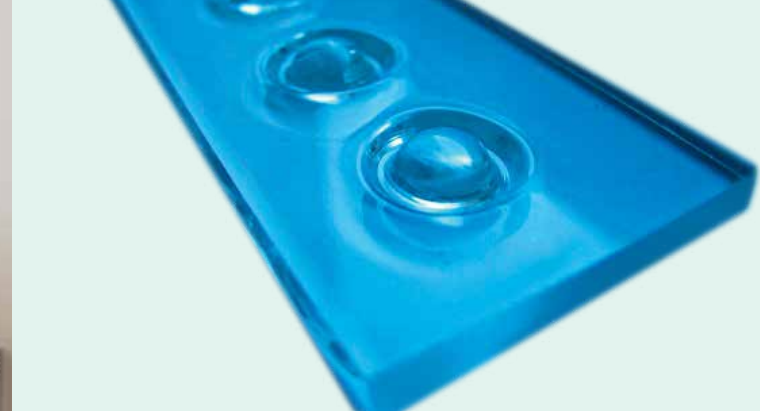
Haptic structures in glass.